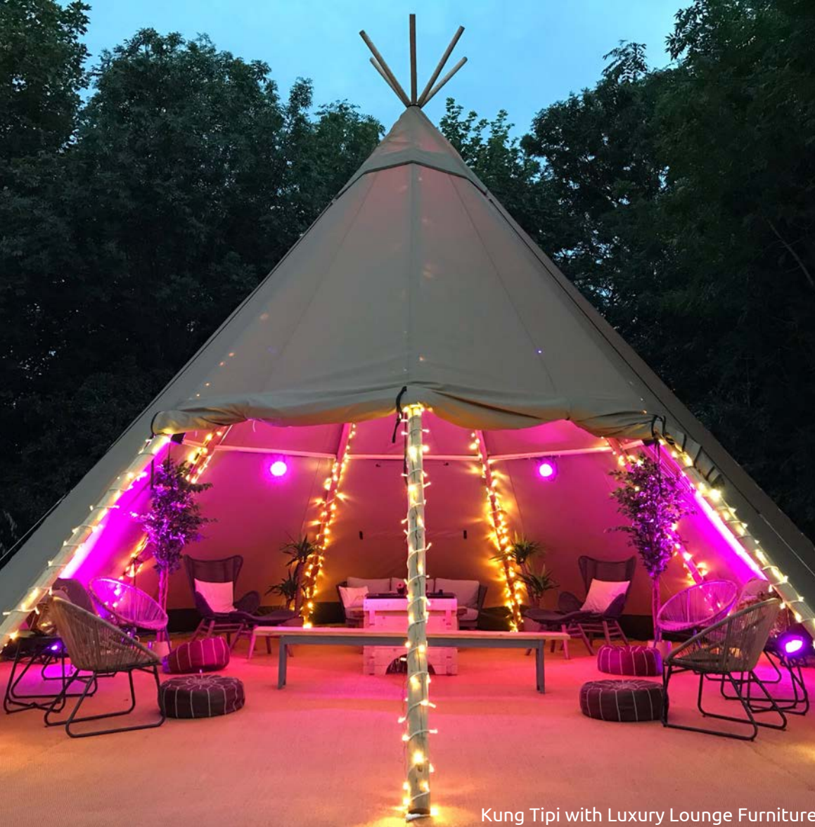
Kung Tipi with Luxury Lounge Furniture